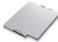
FZ-VZSU84U Standard battery pack