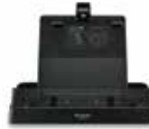
FZ-VEBG11U Desktop cradle (DC-IN, Ethernet, USB 3.0 [2], HDMI, VGA, serial, Kensington cable lock slot) compatible with hand strap and attachments