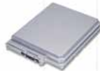
FZ-VZSU88U Long life battery pack