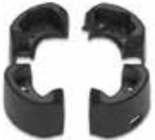
FZ-WCGG111 Tall corner guards (for optional SmartCard reader, long life battery and/or rotating hand strap). Set includes 4 corner guards